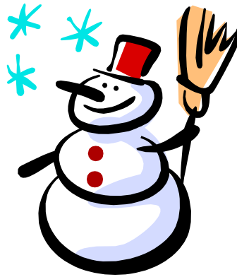
Good books are "cool."

Accelerated Reader participants in grades 3-5 will be recognized at a quarterly assembly on January 12th at 8:30 a.m. Parents of students in those grades are welcome to attend. Check with your child to see how many points they have earned. Remember that students earn Accelerated Reader points by reading during their spare time at home and at school. Students take comprehension tests on the computer to earn points and document their reading efforts.