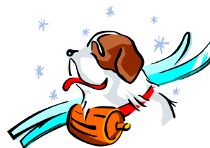
It's cold out there!

At the end of the month, we will count the change and send it to Beverly Bootstraps.