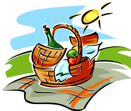
Grade 5 Celebration: June 23 @ 12:45 pm