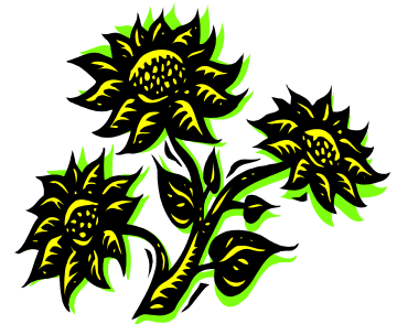
Children grow so fast, just like little flowers.

paint, carve pumpkins, and play hide and seek. You have an excuse to keep reading about Clifford, watch Saturday morning TV, go to Disney movies, and wish on stars. You get great gifts like hand prints set in clay, spray painted noodle wreaths, and cards with backwards letters. For a mere $24.24 a day, there is no greater bang for your buck. You get to be a hero for retrieving a frisbee off the roof, taking the training wheels off a bike, removing a splinter, filling a wading pool, and coaching a baseball team. You get a front row seat in history to witness a first step, a first word, a first date, and a first time be-