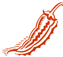
Bootstraps Food Drive and Coats for Kids

lobby. Look for the Bootstraps Food Drive Box. Beverly Bootstraps is a local organization that provides food assistance to families in need. This year, more than ever, there is great need for the holidays and also to help stock the food pantry.