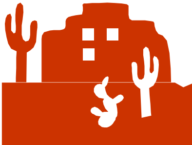
Giddy Up! It's Hannah Horse Café Time

Reservations can be made by calling the Wild Horse Café directly. We will not be