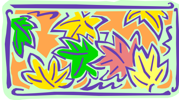
School Store Open Thursdays After School Beginning October 23, 2008

But... remember to park in a marked space and please do not leave your car in the pick up area unattended.