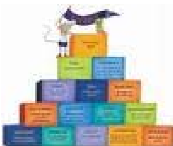
Coach Wooden's Pyramid of Success

Perhaps some of you have heard of Coach John Wooden, a famous UCLA basketball coach. He coached some of basketball's biggest names and was named, "greatest coach of the 20th century." Even though his UCLA teams always had winning seasons, Coach Wooden never emphasized winning. Rather, he focused on teaching student-athletes how to become the best team players they could be...and the best people too. If you were to ask Coach Wooden how he did it, he might reply that he was always true to his beliefs. He captured his beliefs in a structure he called the "Pyramid of Success." Originally designed for high school and college aged students, Coach Wooden adapted his pyramid for younger children using language children would understand.