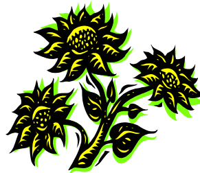
Spring has sprung!

that copies of physical exams be updated every few years and kept on file beginning in the 4th grade. If your child is in the 5th grade, and you did not get a chance to submit a copy of their physical last year, please do so this year, as it is helpful to have the physicals up to date and on file as your child moves on to middle school.